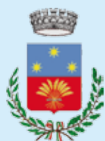
Comune di Ostellato